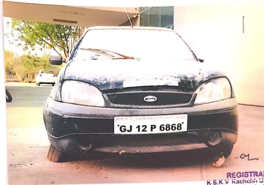
FORD ICON (GJ 12 P 6868) આગળ ની બાજુનો કલર ફોટો નંબર પ્લેટ સાથે. (front colour photo)

REGISTRAR K.S.K.V Kachchh University Bhuj-Kachchh